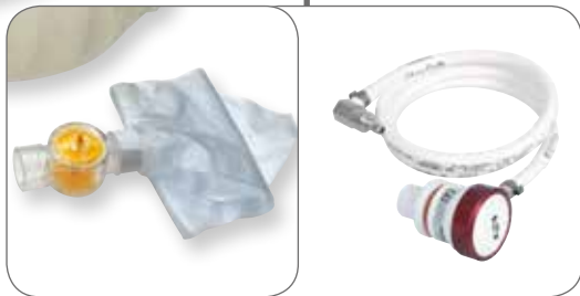
Adapter fits oxygen reservoir or OXYMAND demand valve